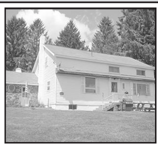
#127492 UNBELIEVABLE! 150 Acres, 2-ponds. Includes a 5BR/2BA Farmhouse. Garages, Barn, Double Wide & Single Wide ......$440,000