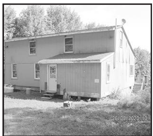
#127789 SLEEPS TEN?! Secluded hunting camp or getaway. Half mile setback from road with 50 acres of land to roam....$144,900 TEXT H554982 to 843367