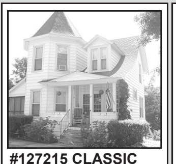
VICTORION Complete with Turret! 3BR/2BA. Original Woodwork, large KIT, breakfast nook. Brand New to Market!......$130,000 TEXT H555032 to 843367