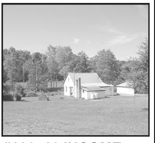
#126416 INCOME VENTURE Used as an Airbnb, featuring modern conveniences, 2BR, 1BA on 22 acres, plus 3 large outbuildings