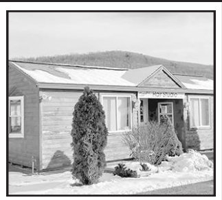
#129313 LOCATION, LOACTION! Next To Walmart, GREAT spot for a future business. .87 Acre – plenty of parking! $99,900 TEXT H555042 to 843367

6095 State Hwy. 12, Norwich, NY / 607-336-8080