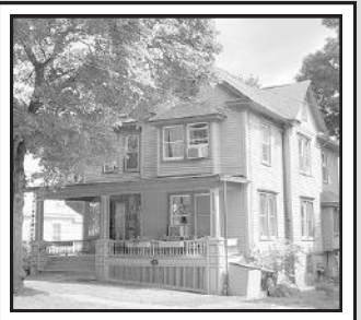
#127805 SPACIOUS HOME Features gorgeous woodwork throughout. 5BR, 3.5BA., HW floors, pocket doors, gas FP. 2-car garage.....$209,000 TEXT H555012 to 843367