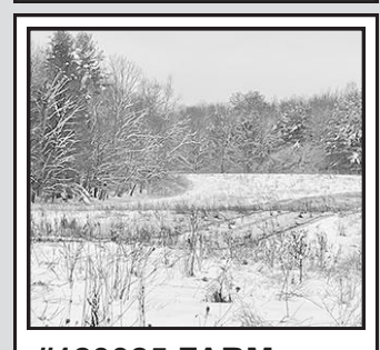
#129325 FARM, HUNT, BUILD 102 Acres currently used for farm crops/ hunting. Could be a great home site. Small Pond too!.........$199,999 TEXT H555052 to