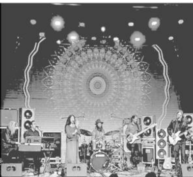
AUGUST 8 THE GARCIA PROJECT