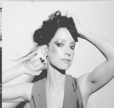
AUGUST 1 SISTER SPARROW & THE DIRTY BIRDS