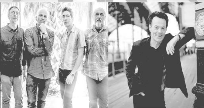
JULY 18 THE IGUANAS