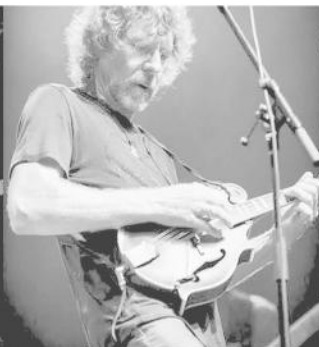
AUGUST 22 SAM BUSH BAND