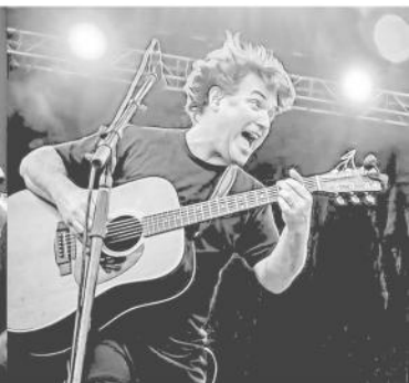
AUGUST 29 KELLER WILLIAMS