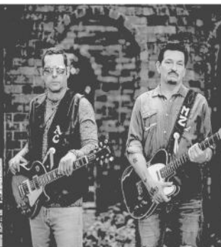
AUGUST 15 BLOOD BROTHERS & LOS BLANCOS AT 6:30 PM