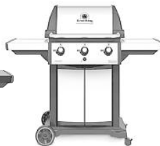
SIGNET Model 320