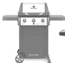
GEM Model 310