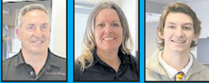
Paul Shelly Jason

158 CTY RD 32A - NORWICH, NY (HALE STREET EXTENSION)